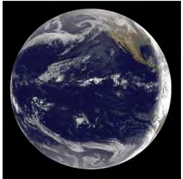
THE OCEAN FROM SPACE. This infrared image from the GOES-11 satellite shows the Pacific Ocean.

E Most of Earth’s water (97%) is in the ocean. Seawater has unique properties. It is salty, its freezing point is slightly lower than fresh water, its density is slightly higher, its electrical conductivity is much higher, and it is slightly basic. Balance of pH is vital for the health of marine ecosystems, and important in controlling the rate at which the ocean will absorb and buffer changes in atmospheric carbon dioxide.