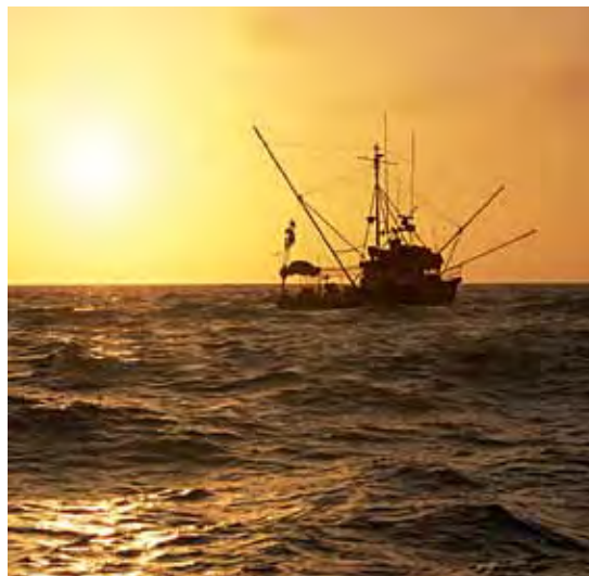
THE DAY'S CATCH. A commercial fishing vessel off the coast of Santa Cruz, California returns to port.